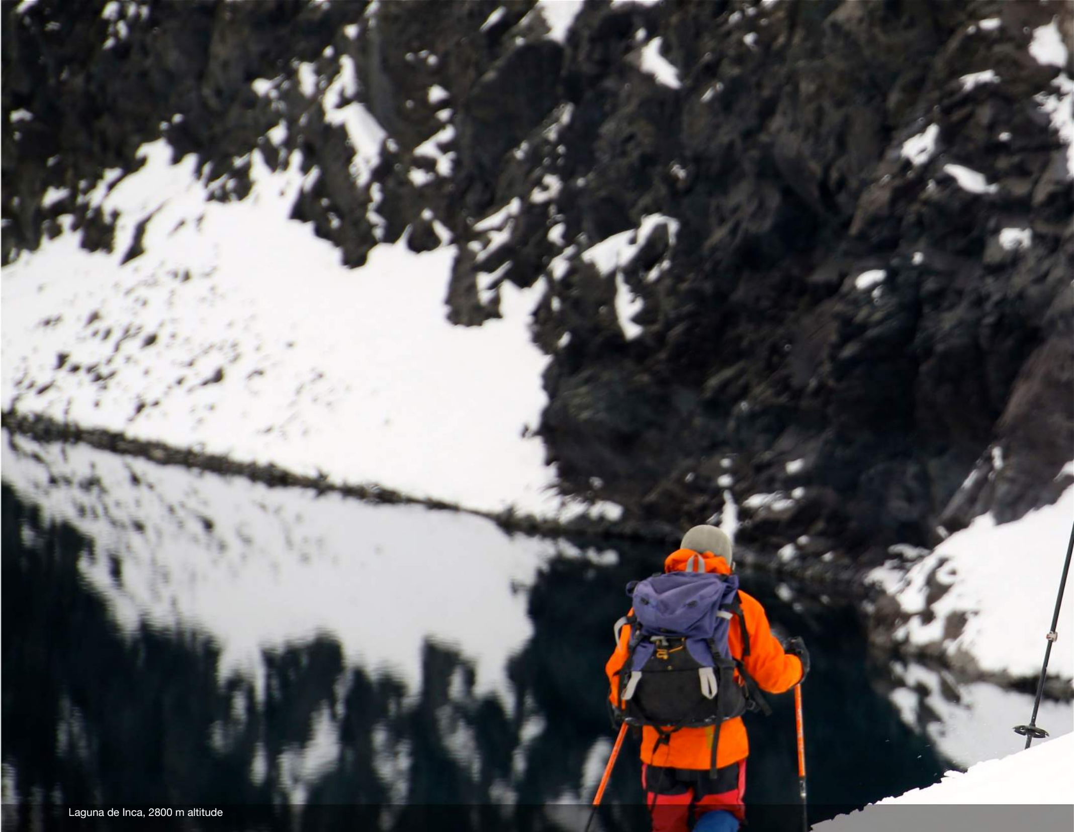
Laguna de Inca, 2800 m altitude