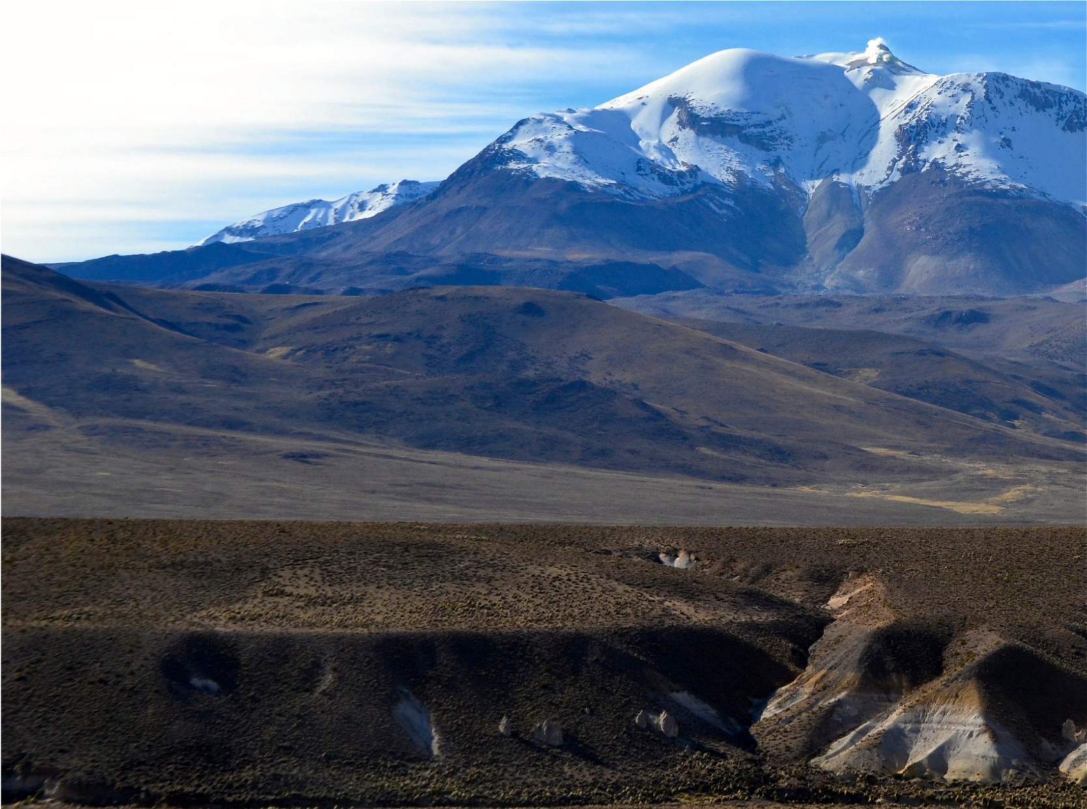
Volcan Guallatiri, 6063 m altitude