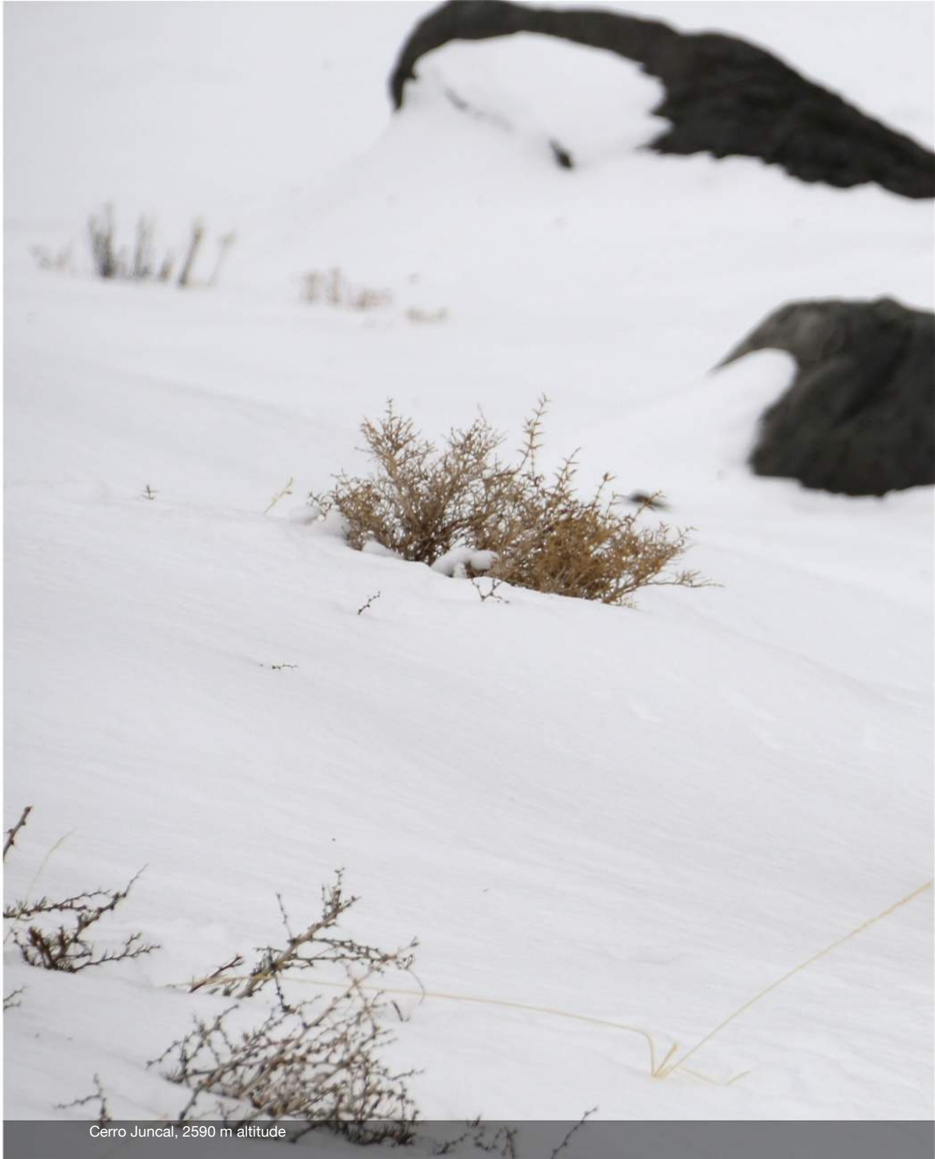
Cerro Juncal, 2590 m altitude