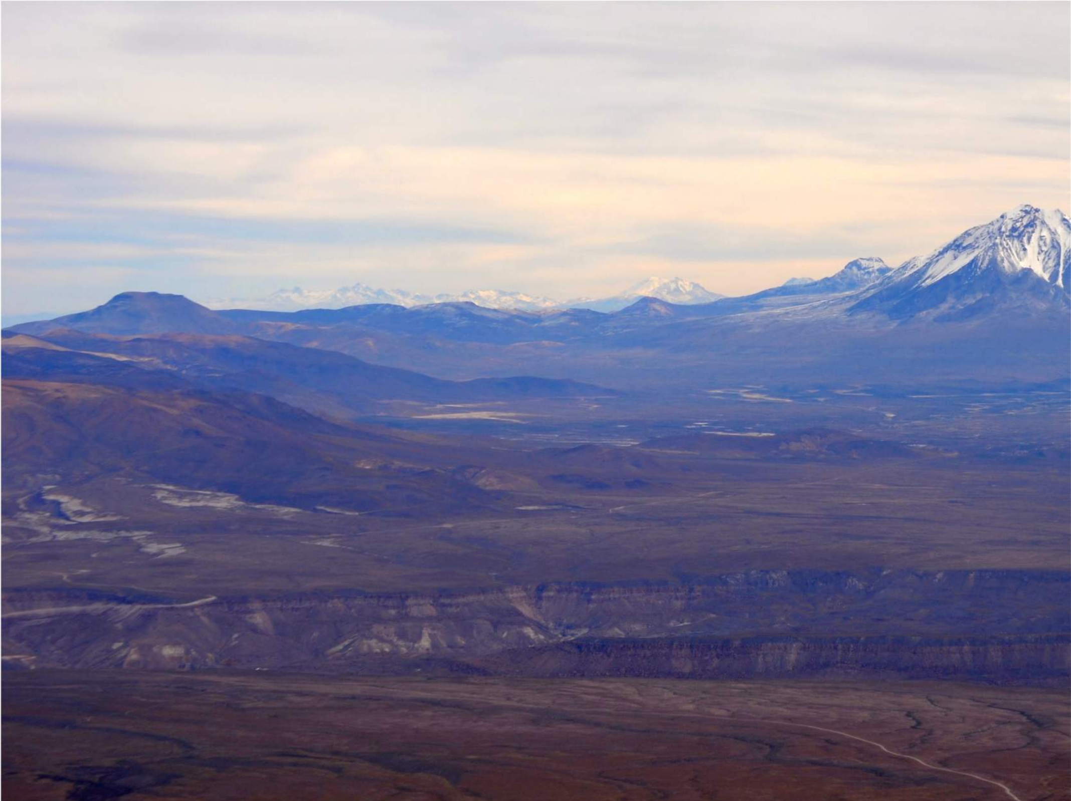
Nevados de Putre, 5200 m altitude