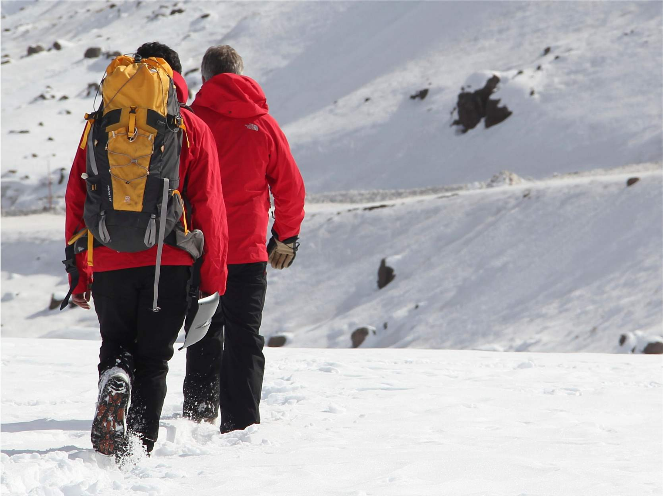
Valle Nevado, 2600 m altitude