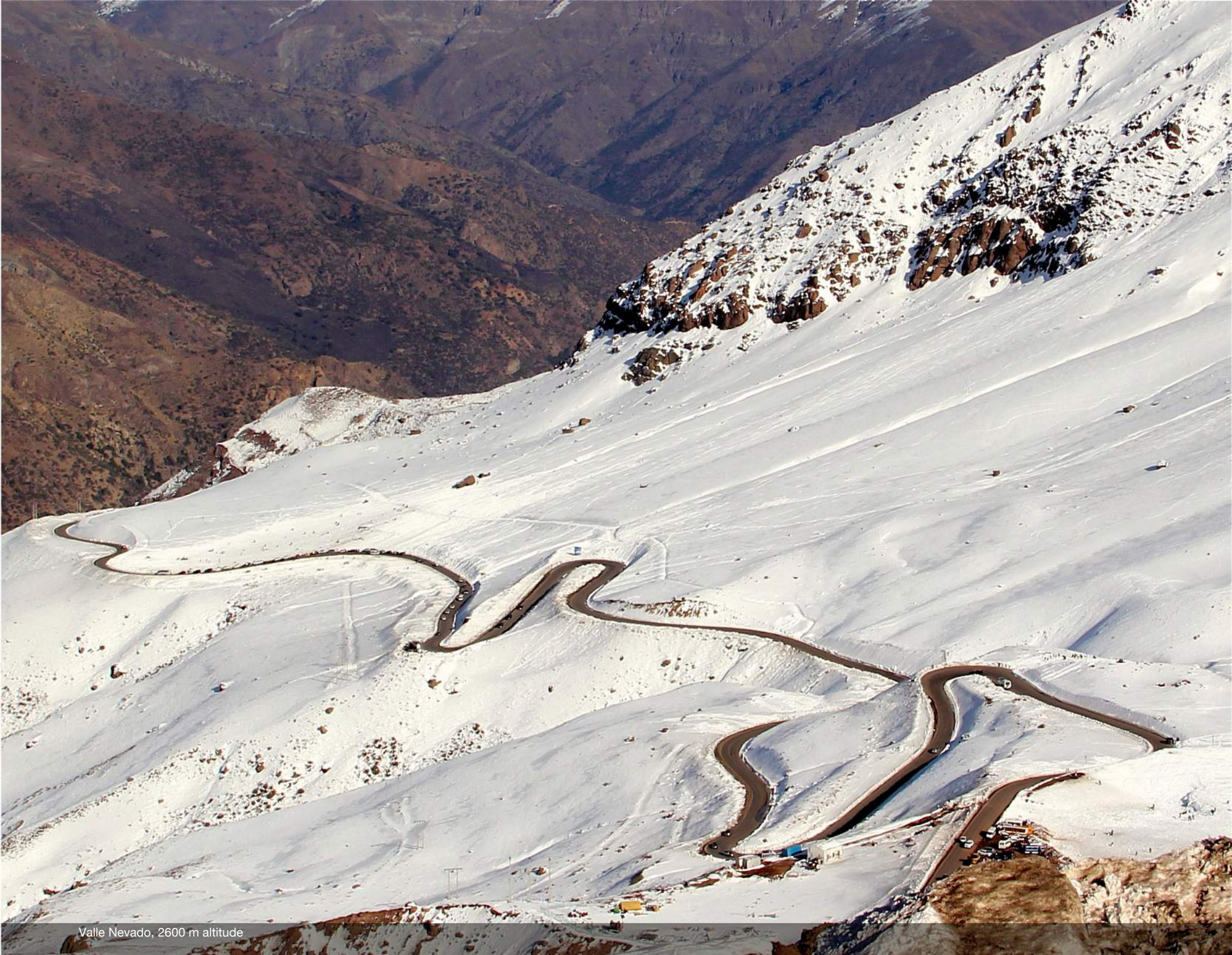
Valle Nevado, 2600 m altitude