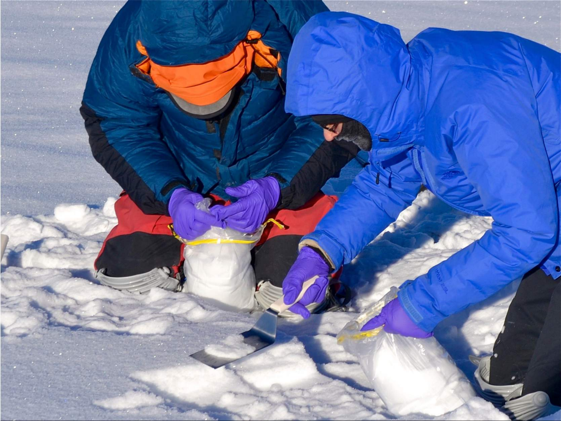
La Ola, 3600 m altitude