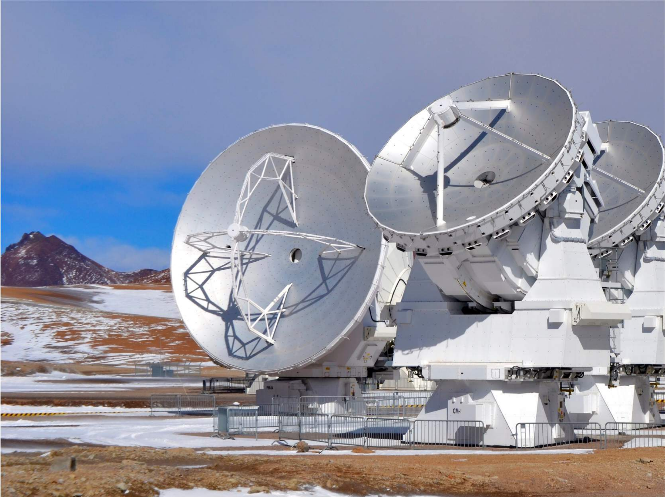
Chajnantor Plateau, 5058 m altitude